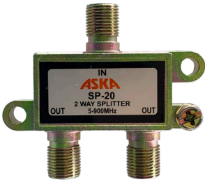
Model No.: SP-20 2 WAY SPLITTER Stock Qty: 1429PCS