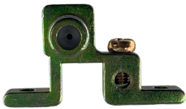
Model No.: GB-1 5-1000MHz 1 F Ground Block Stock Qty: 3000PCS