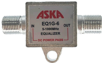
Model No.: EQ1G-6/9/12 5-1000MHz Equalizer Stock Qty: 84 PCS - 6dB 262PCS - 9dB 95 PCS - 12dB