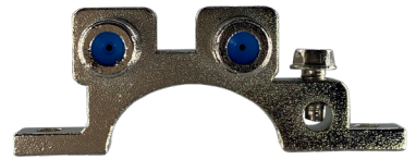
Model No.: GB-2UL 5-2500MHz 2 F Ground Block Stock Qty: 2000PCS