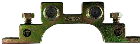
Model No.: GB-2D 5-1000MHz 2 F Ground Block Stock Qty: 3500PCS