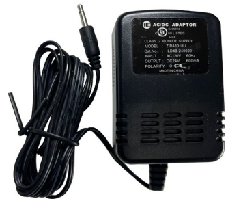
Model No.: PS-6M 120VAC, 24VDC, 600mA with Mini plug Stock Qty: 69 PCS