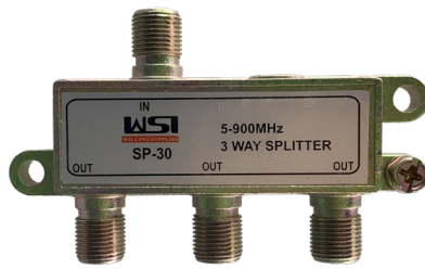
Model No.: SP-30 3 WAY SPLITTER Stock Qty: 43PCS