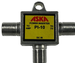
Model No.: PI-10 5-2300MHz Insertion Loss: 0.5dB max Capacity: 60VDC 1Amp Stock Qty: 391PCS